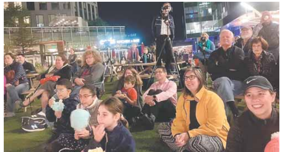
A large crowd gathered to watch the Traveling Players Ensemble perform on The Plaza at Tysons Corner Center.