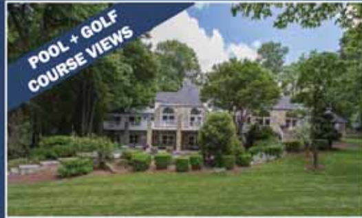
Great Falls $1,799,000