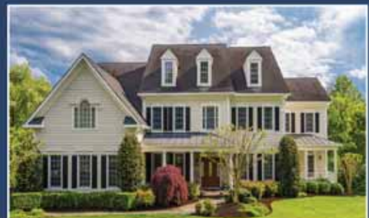
Great Falls $1,700,000