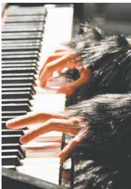
Langley High School Orchestra members perform in the 'Fur, Fins, and Feathers' concert.

The contribution and effort put in by the students, directors, and assisting parents made it possible to create a zoo inside of the Langley Auditorium and brought the orchestra's year off to an incredible start.