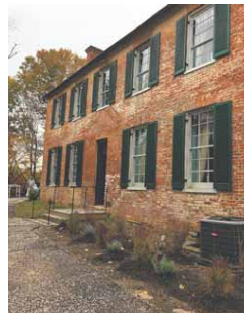
The historic Colvin Run miller’s house: Inside, moments are frozen in time from the Federal and Victorian periods of Fairfax County during the 1800s.