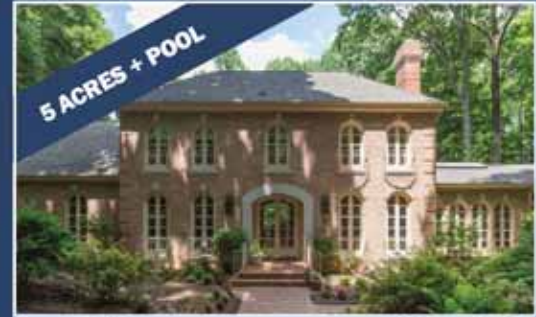
Great Falls $2,499,000