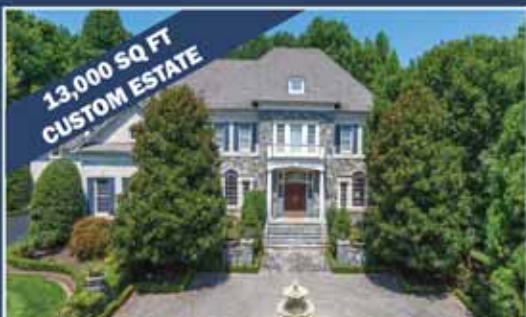
Great Falls $3,499,000