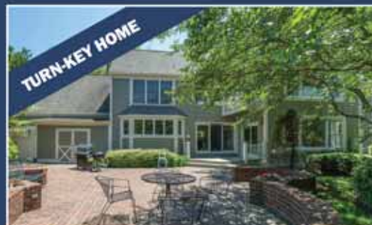
Great Falls $1,150,000