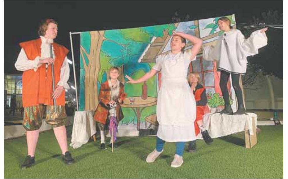
The Traveling Players Ensemble performs on The Plaza at Tysons Corner Center.