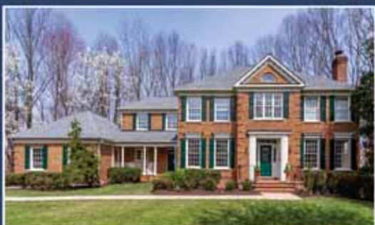
Great Falls $1,150,000