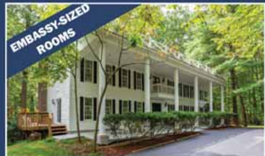
Great Falls $1,149,000