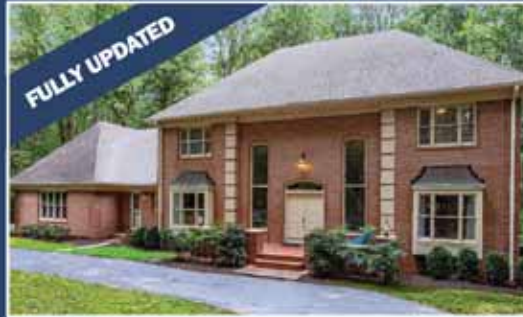
Great Falls $1,600,000