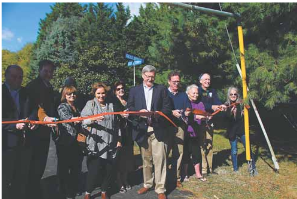
Fairfax County officials and Great Falls residents are happy to open a new segment of the pedestrian walkway from Falls Bridge Lane to Seneca Square along Georgetown Pike.