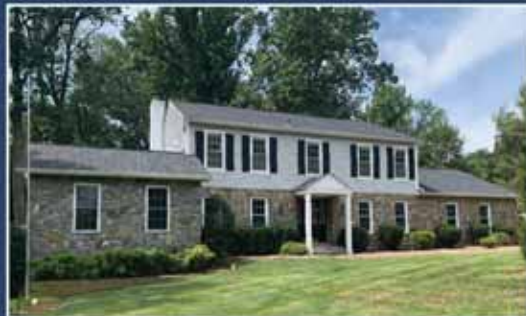
Great Falls $1,140,000