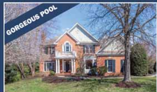
Great Falls $1,350,000